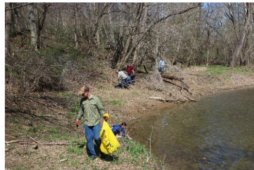
PVFF members cleaning up the shores of the Catoctin Creek