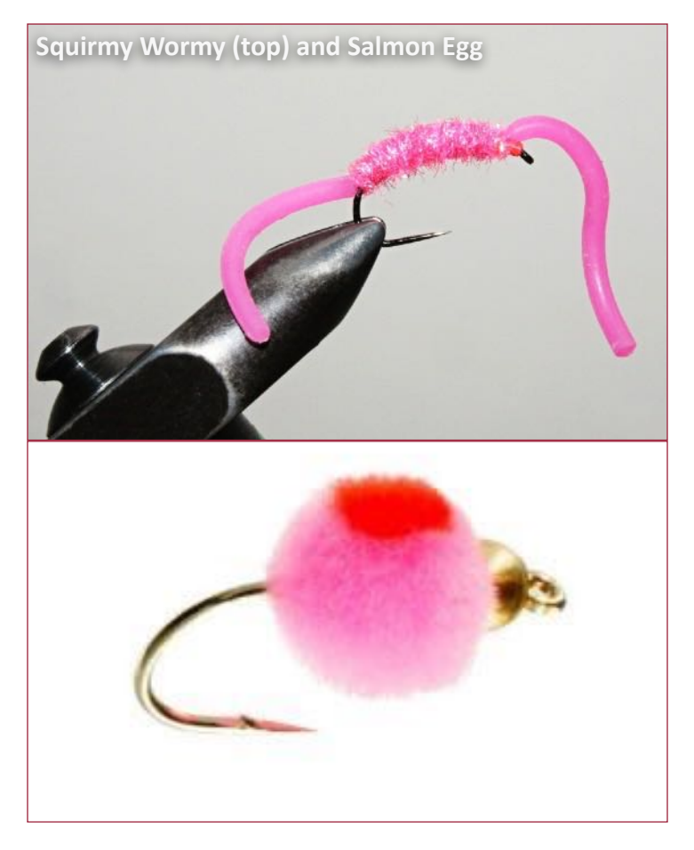
sessions; i.e. 'how, when and where to fish the fly patterns' which are selected for the respective tying sessions.

Please note that we plan to incorporate a new component into the 2023 Beginner Fly Tying