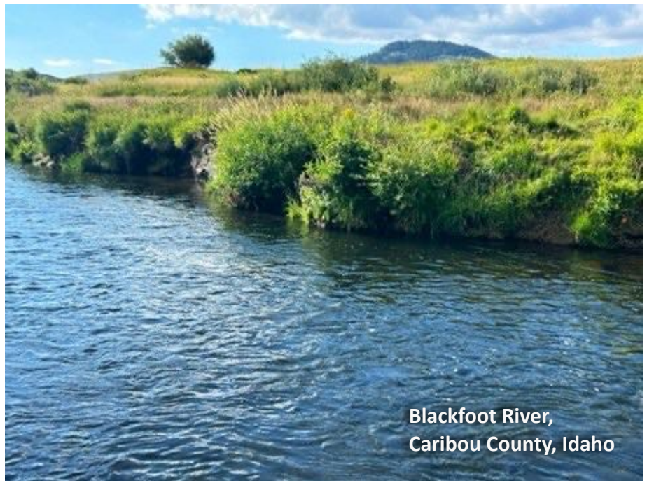
Blackfoot River, Caribou County, Idaho

On August 8 and 9, 2023, I fished Spruce Creek, a famous limestone creek, in Spruce Creek, Pennsylvania at Evergreens Farms. While I had